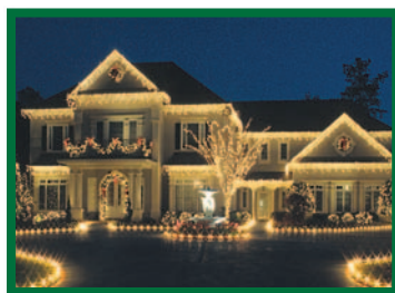
Home 'Lighted Up for the Holidays'

Listen to 'Tree Talk for Texas' 9:00 a.m. Fridays on KRFE AM 580