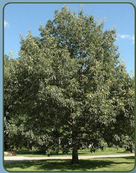
Chinquapin Oak ( Quercus muhlenbergii )

Although Chinquapin grows throughout the eastern half of the US, it is also native in southern NM, far west Texas and northern Mexico. It prefers well drained soils and is tolerant of slightly acidic to slightly alkaline soils.