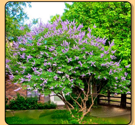
Vitex or Lilac Chaste Tree ( Vitex agnus-castus )

Vitex has purple blooms that cover the plant for over two months in early summer. Occasionally they will have a second bloom in late summer, especially following a rainy spell after a dry spell. They have become very popular and deservedly so. They should be abundant in the nurseries.