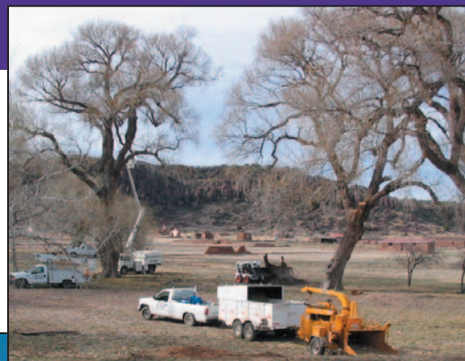
Fort Davis Mountains Cottonwoods