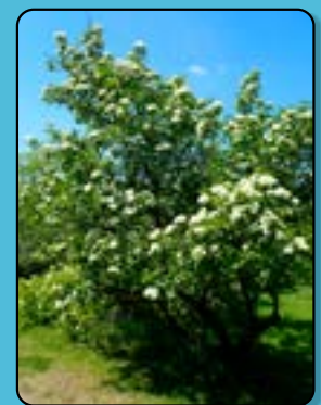
Rusty Blackhaw ( Viburnum rufidulum )

It is a great tree to plant along the back fence if you have overhead utilities.