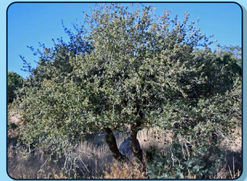
Grey Oak ( Quercus grisea )

Grey Oak, Quercus grisea . Is a small to medium Live Oak that is native to SW Texas, New Mexico, Arizona and northern Mexico. It is commonly found on dry rocky sites and it is very drought tolerant. When it is planted in a watered landscape, it will grow faster and get a bit bigger but still only a medium size tree. Foliage has a little bit of a greyish or glaucous cast. It isn't as blue as the Mexican Blue oak but it will hybridize with it. It is a great tree for an arid landscape in a small yard. Finding it in the nursery trade might be a little iffy but well worth the effort.