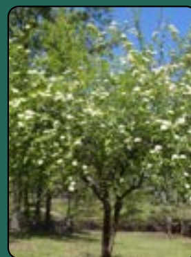
Rusty Blackhaw ( Viburnum rufidulum )

Not every nursery will have it, but if you keep asking for it, they will start getting some. If you find it, please try it. Otherwise, the nursery won't keep carrying it.